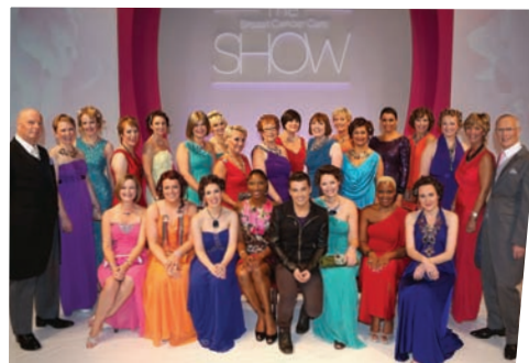
At London fashion show with the models