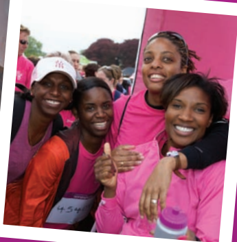
Pink Ribbonwalk with friends