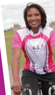
Cycling Bike Blenheim Palace